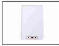
AZ RT 43 Receiver