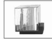
AZ FL 19 Flash Lamp