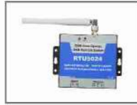
AZ GSM 30 GSM Module