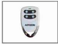
AZ T21W Transmitter