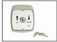
AZ KS 15 Key Switch