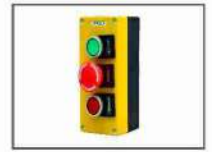
AZ PB 16 A Push Button