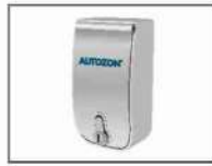
AZ RS CM 03 Manual Clutch & Switch