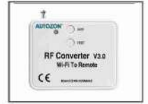
AZ RF WIFI 31 A Wifi Module