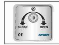
AZ KS 15 A Key Switch