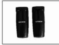
AZ PC 10 Photocell